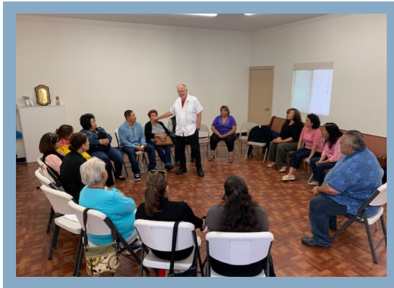
JRJI Parent Retreat in 2019